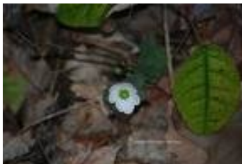
Join us March 26th for a Field Trip to the Pocket.