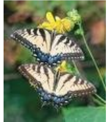
Easter Tiger Swallowtails female March 7th Potluck Supper 6:30pm BBG